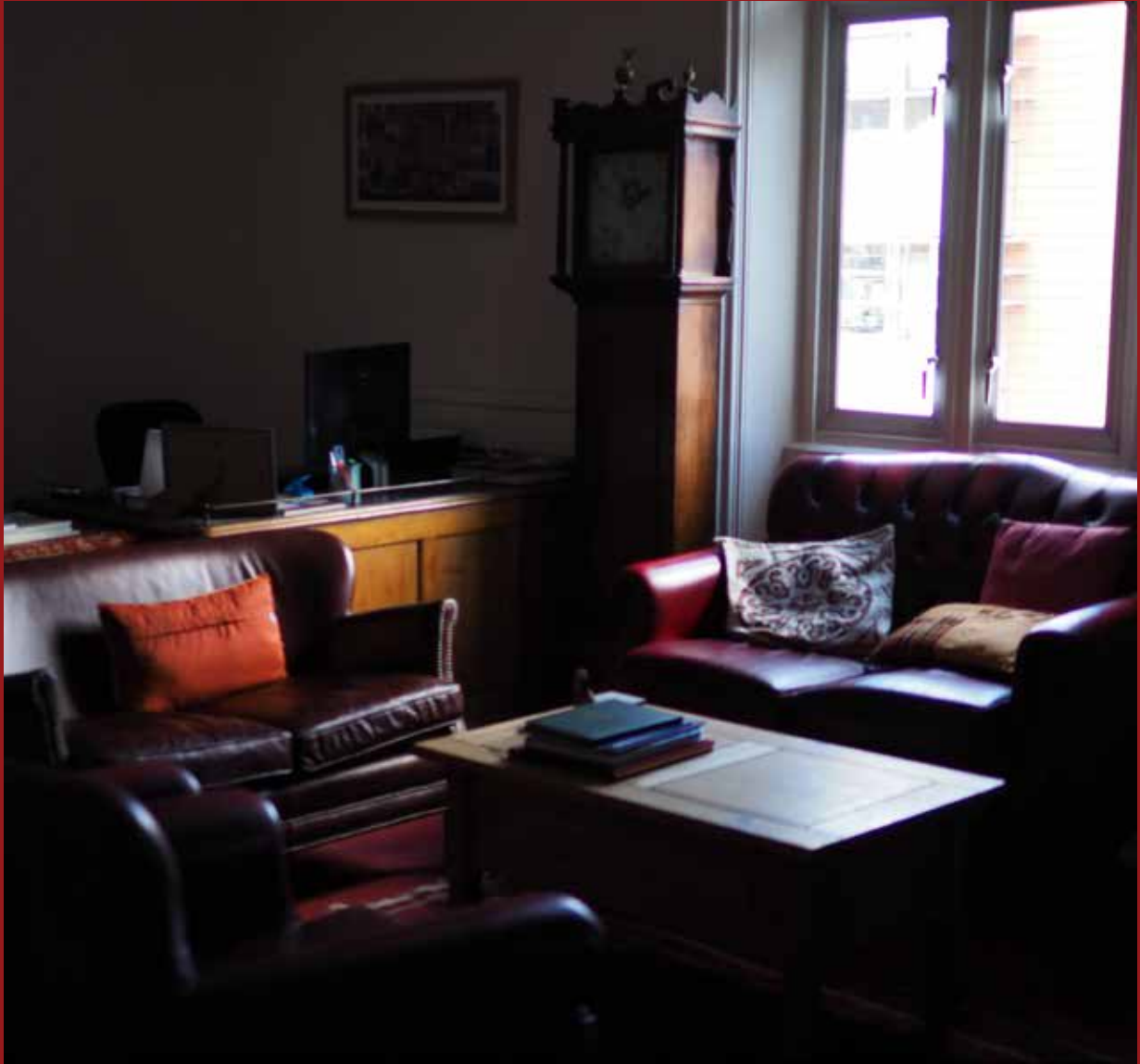
THE COMMON ROOM